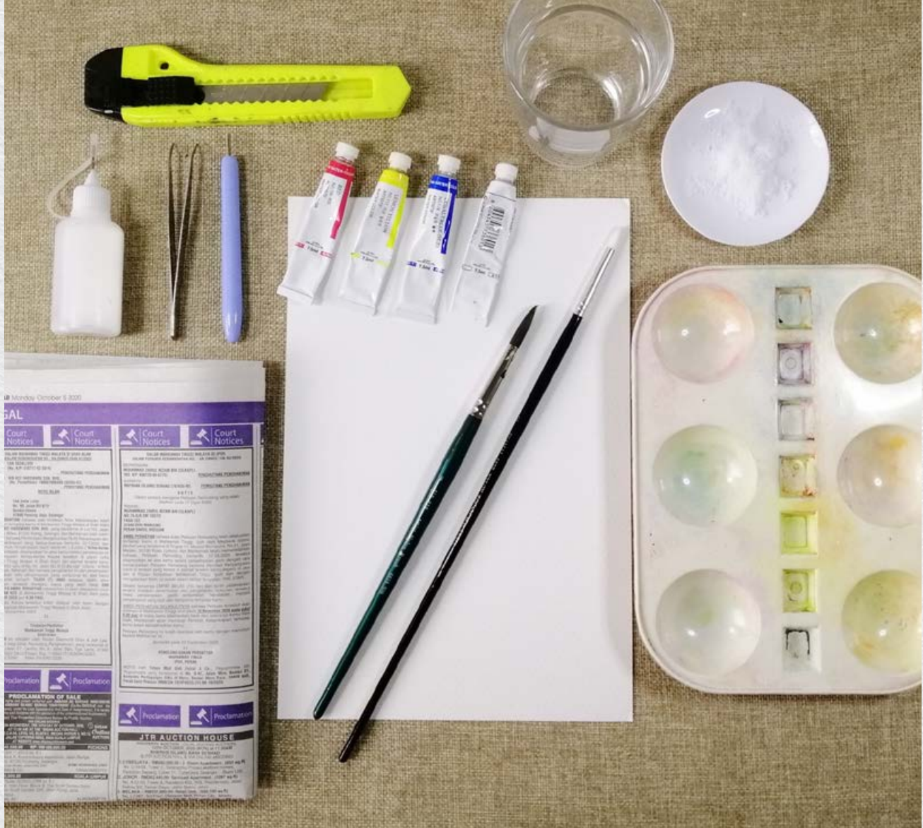
Materials: Newspaper, Glue, Tweezers, Quilling Pen, Penknife, Paper, Paintbrushes, Watercolours, Palette, Water and Salt