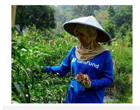
Investment solutions with purpose and that create a positive environmental and social impact