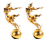
Thailand Tourism Award Excellence Day Spa 2008, 2010

Enjoy the experience and find out for yourself why Oasis Spas received the coveted "Tourism Award of Excellence Day Spa" multiple times along with many other prestigious awards.