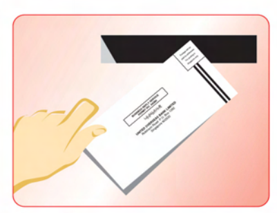
Step 3 Post your application or drop it at any UOB Group branch.