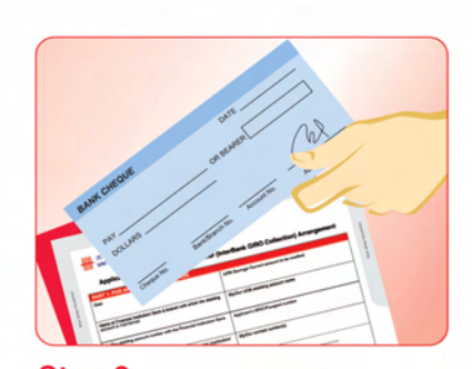
Step 2 Attach your cheque, payable to yourself with your crediting account number indicated on the back of the cheque.